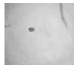
Fig. 3. Image of the harvested organoid.